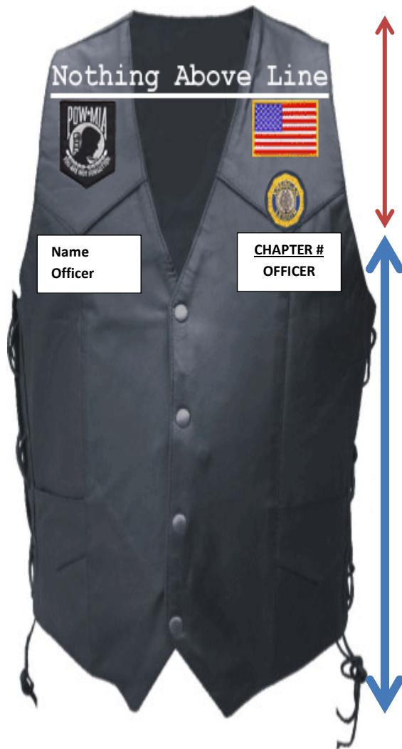
FRONT OF VEST